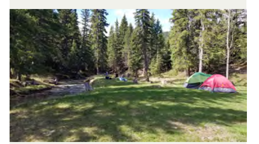
Random camping in the Porcupine Hills Public Land Use Zone (MD of Willow Creek).

To quantify the economic impact of campgrounds within a municipality