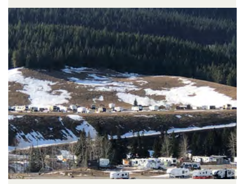
Green Mountain RV Park (Municipality of Crowsnest Pass).