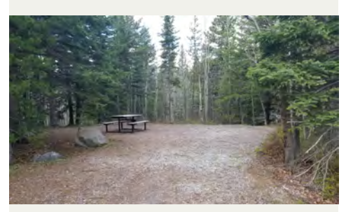
A camp site at Beaver Mines Lake campground within Castle Provincial Park (MD of Pincher Creek).